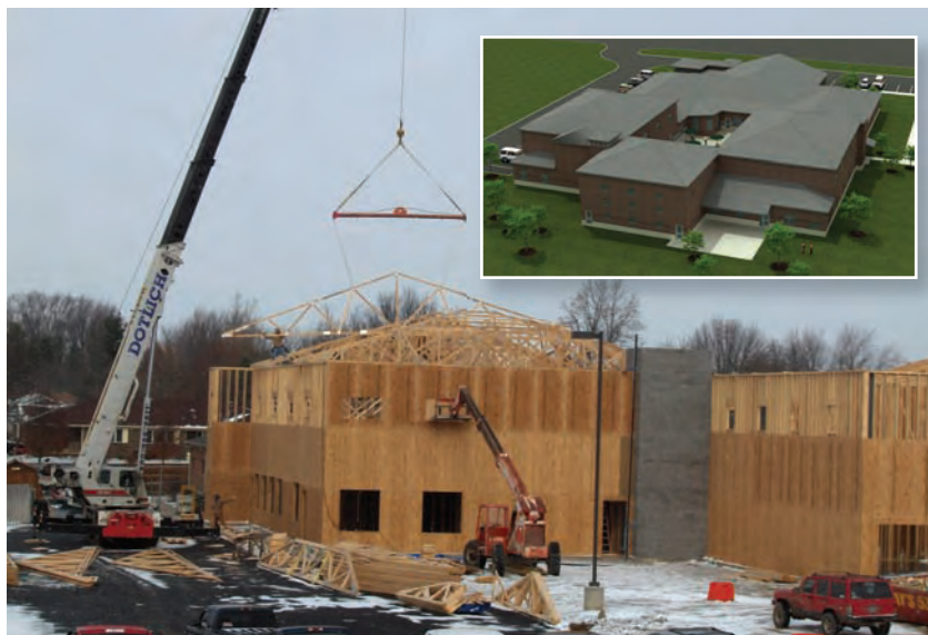
The Hendricks County Community Foundation continues to support Sheltering Wings which provides emergency housing for all women and children suffering from any form of domestic abuse. Pictured above is the expansion project in March 2011 and a conceptual drawing of the expansion. In 2010, HCCF awarded Sheltering Wings a $10,000 grant from the Deedee Daniel Opportunity Fund for their new expansion and a $25,000 grant from the Anderson Family Fund for general operating expenses.

2010 ended on an exciting note. Our assets once again reached above $8 million. The increase in assets allowed our grantmaking to exceed $625,000 in 2010. For a complete list of funds and grants made in 2010, please visit our website at www.hendrickscountycf.org . We are thankful for the continued generosity of our fund representatives and donors whose contributions grow our assets and grants. Please consider a donation today via the enclosed envelope or on our website.