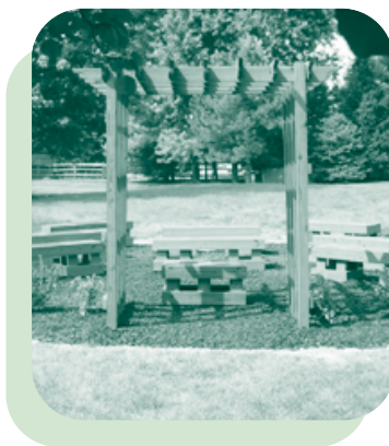
Outdoor Reading Retreat at Avon-Washington Township Public Library

building materials. Next time you stop by the Avon-Washington Township Public Library, check out the outdoor reading room.