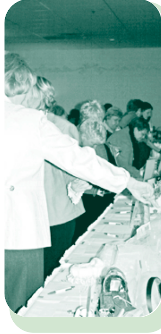
Ladies at the Habit of the Heart luncheon enjoy the silent purse auction where over 50 purses were auctioned.

The Habit of the Heart Gala Weekend was held September 29-30 at Primo Banquet and Conference Center. This weekend benefited the Hendricks County Community Foundation and the Habit of the Heart Fund, helping meet emergency needs of women and youth in Hendricks County. The event featured a raffle for a heart-shaped ruby, a live auction and a silent purse auction, which collectively helped raise more than $18,500. Participants heard from two guidance counselors who applied for grants from the Habit of the Heart Fund and were able to share their stories about the significant impact the grants have made on the lives of their students.